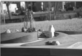
The popular "Changing Course"

Thanks to Houligans for renewing your DECI membership. We appreciate your support!